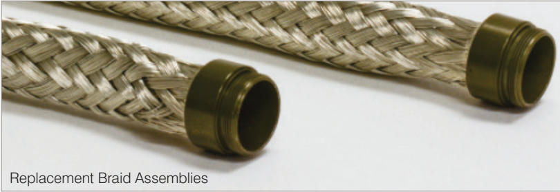
Replacement Braid Assemblies