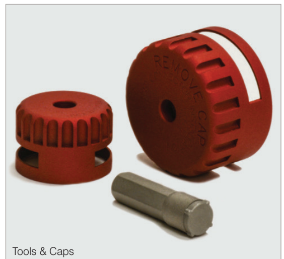
Tools & Caps

Please contact sales for more information on strain relief replacement hardware