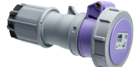
Type CLV...W 16 A...32 A, IP67