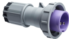
Type PLV...W 16 A...32 A, IP67