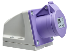
For surface mounting, Type BSLV... 16 A...32 A, IP44