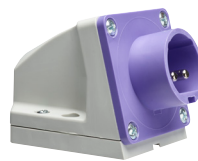
For surface mounting, Type RSLV... 16 A...32 A, IP44