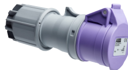
Type CLV... 16 A...32 A, IP44