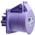
For panel mounting with straight flange, Type RLV... 16 A...32 A, IP44